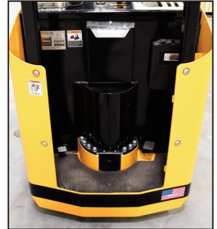
Low Step Height Operator Rear Entry