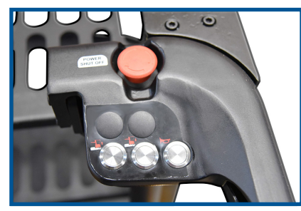
RIGHT HAND CONTROLS

The right-hand operator control pod features fingertip lift/lower buttons for the operator platform and a recessed emergency power disconnect. On the left-hand control pod, a cup holder, horn, and battery discharge indicator with hour meter are provided.