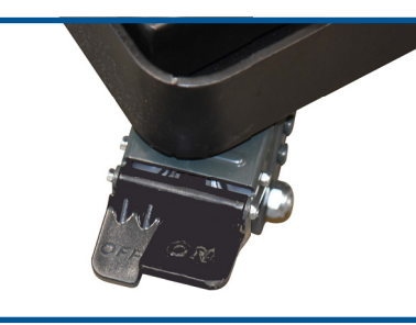
REAR LOCKING SWIVEL CASTERS